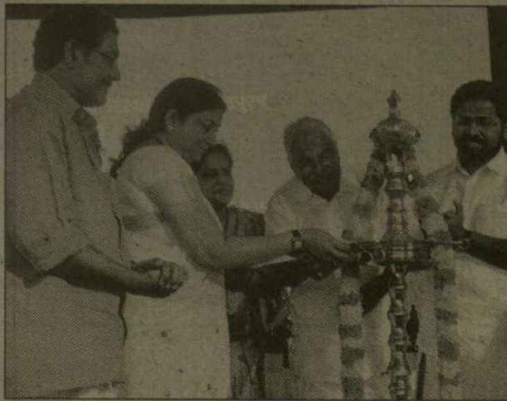
तिरुवनंतपुरम के बितुर में भारतीय विज्ञान शिक्षा एवं अनुसंधान संस्थान के स्थायी परिसर का उद्घाटन करती मानव संसाधन विकास मंत्री स्मृति ईरानी।

ईरानी ने तिरुवनंतपुरम के बितुर में भारतीय विज्ञान शिक्षा एवं अनुसंधान संस्थान के स्थायी परिसर का उद्घाटन करते हुए यह अपील की। उन्होंने कहा कि देश के वैज्ञानिक शोध संस्थानों को इस बात की कोशिश करनी चाहिए कि वे महिलाओं, दलितों तथा आर्थिक रूप से पिछड़े वर्ग के छात्रों को आगे बढ़ने के अधिक से अधिक अवसर प्रदान करें।